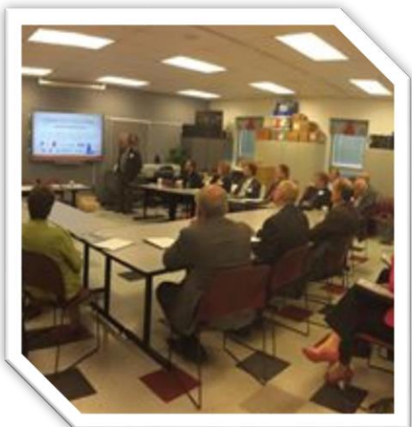
Food Policy Council meeting with USDA representatives

The Food Policy Council will update their Action Plan, apply for grant funding to support ongoing projects, and consider the need or opportunity for a commercial interest in the downtown Lima area.