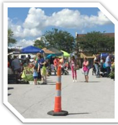
Farmer's Market, Lima