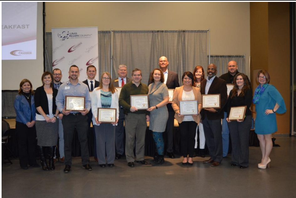
Fall 2016 Activated Business Challenge Award Winners

The Collaborative will continue to meet on a quarterly basis to promote the ABC, review and promote the annual activities that will be included in the ABC (local 5Ks or other challenges), oversee the Award & Recognition structure, and monitor the Employer Toolkit to ensure it stays current with timely content. Future plans also include an evaluation of how the Creating Healthy Communities initiatives and resources can best be utilized to assist local businesses in developing workplace wellness programs.