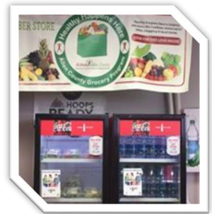
Healthy Happens Here Corner Store Initiative: Seven stores are offering healthier options